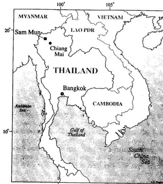
Fig. 1 The Sam Mun study area in northern Thailand.

area is referred to herein as Sam Mun (Fig. 1), and described in detail in Ziegler & Giambelluca (in press). Sam Mun ranges in elevation from 750 to 1850 m a.s.l. The area has a monsoon rainfall regime with a rainy season extending from mid-May through October or early November, during which approximately 90% of the 1000-1200 mm annual rainfall occurs.