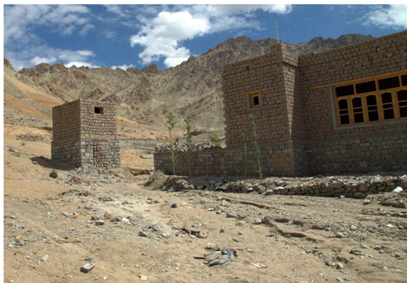
Figure 5. A new house built in the dry channel of the Skampari Stream, which flooded both in 2010 and 2015. The house (right) and the toilet (left) are built on opposing 'banks' of the ephemeral stream. New housing has sprung up in response to a wave of recent immigrants. Over the last 50 years, the numbers of houses in the area have also increased with the change from polyandrous to nuclear families. Tourism is also driving urbanization

flows (Santi et al. , 2010), in Thailand and India following recent large floods (Ziegler et al. , 2012 a,b, 2014), as well as on coasts following tsunami inundation (Ziegler et al. , 2009). Rebuilding or relocating is also a very complex and sensitive issue because it often results in unintended negative social consequences (Barenstein, 2015).