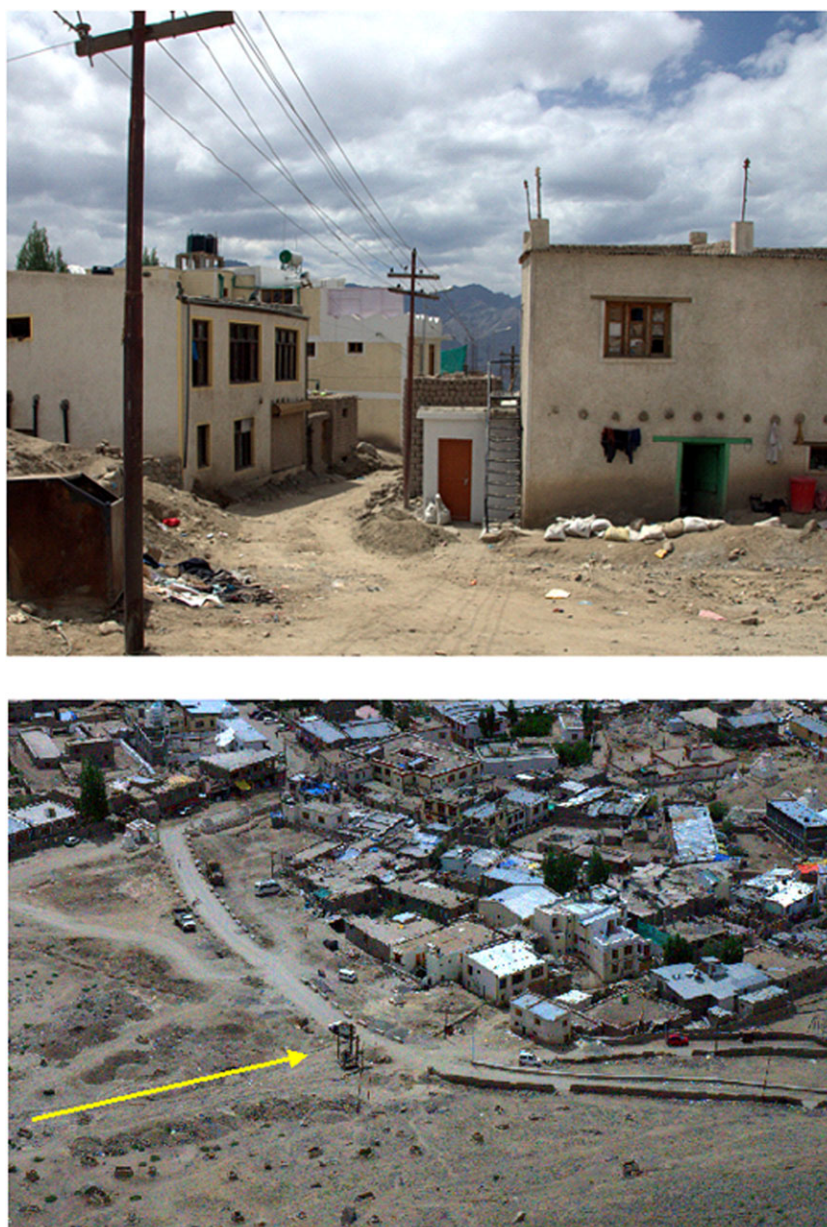
Figure 2. Leh 2015. The top photo shows the location of a former channel of the ephemeral Skampari Stream that ends abruptly in a residential neighbourhood at a small road leading to the Leh Market. The 1-m high water marks from the 2015 flood can be seen on the building on the right. The debris pile on the left was deposited during the 2010 flash flood and debris flow that entered the city. The bottom photo shows the (now) dry Skampari Stream where it enters the neighbourhood; the ephemeral stream flows from the bottom left corner of the photo (arrow)

is built almost entirely on the rubble field of historical debris flows that were probably triggered by landslides. The ruins of Shey Monastery sit on the gravels of a former channel of the Indus River, where it once intersected hillslope colluvium generated by prior mass movements and sheet flows caused by surface runoff. Recurrent floods forced the inhabitants to rebuild at higher elevation. The destructive and recurrent nature of these rare environmental hazards, which can be seen in the sedimentary record exposed in stream banks and below old settlements, is cause for alarm. The evidence