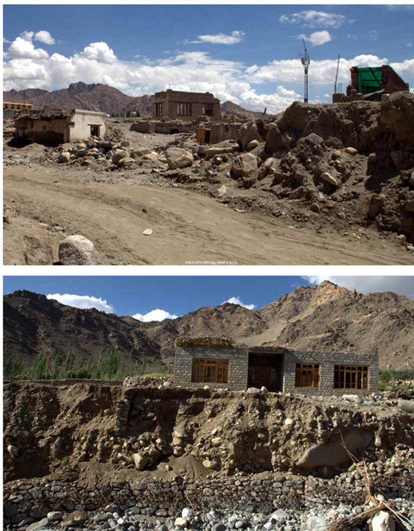
Figure 3. (Top) Partially buried homes and piles of debris still remain in 2015 adjacent to the stream in Choglamsar where a debris flow devastated a residential area in 2010. Most local residents rebuilt in place—and as a result, many were victims of flooding again in 2015. (Bottom) A home rebuilt along the Sabu Stream on a former debris flow

paucity of vegetation on hillslopes to intercept rainfall and the thin hillslope soils with limited water storage capacity contribute to flash flood generation. Second, ample sediment is present to contribute to the initiation of debris flows. Leh and surrounding villages are located in one of the widest segments of the Indus River valley, which is bound by intensely deformed sedimentary rocks of the Zaskar Range in the south and a batholith of foliated granite in the north. The Indus River is flanked by wide and steeply dipping alluvial and colluvial fans that originate from the Zaskar Range, funnel-shaped fans originating from the batholith, and fluvial terraces (Santi et al. , 2010). The valley walls at places are mantled by sand ramps. All these geomorphic elements create extensive barren surfaces with semi-consolidated sediments beneath that potentially become sources of clastic material