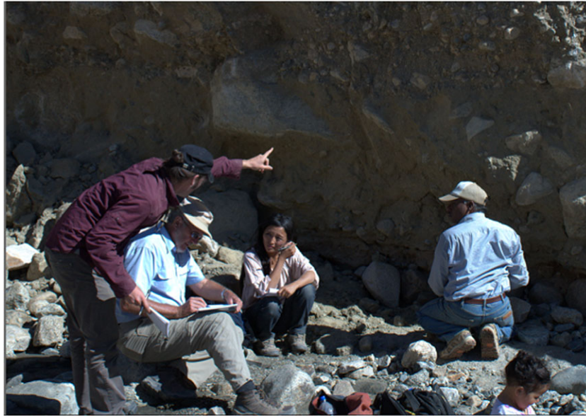
Figure 4. Several of the authors collecting samples for optically stimulated luminescence dating of debris flows (used to calculate reoccurrence intervals) in the Nang Stream, which drains from headwater glaciers to the Indus River

flow hazards than the tragedies of the last decade have exposed.